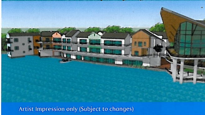
Artist Impression only (Subject to changes)

The main clubhouse will undergo major refurbishment and will include a grand lobby and reception area as well as eight boutique rooms for guest accommodation, four of which will have balconies overlooking the ocean and marina.